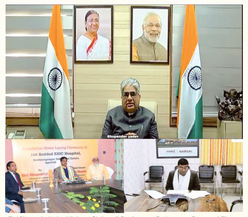
Shri Bhupender Yadav, Minister of Labour & Employment, Environment, Forest and Climate Change, Government of India laid the foundation stone of 100 bedded ESIC Hospital, Tripura from New Delhi in a virtual event. Prof. (Dr.) Manik Saha, Chief Minister, Tripura graced the occasion as Chief Guest and Shri Rameswar Teli, Minister of State for Labour and Employment, Petroleum and Natural Gas, Government of India was Guest of Honour in the event.

of establishments, industrial, commercial, agricultural or otherwise. Under these provisions, the State Governments have extended the provisions of the Act to shops, hotels, restaurants, cinemas including preview theatres, road motor transport undertakings, newspaper establishments, educational, medical institutions employing 10 or more employees.