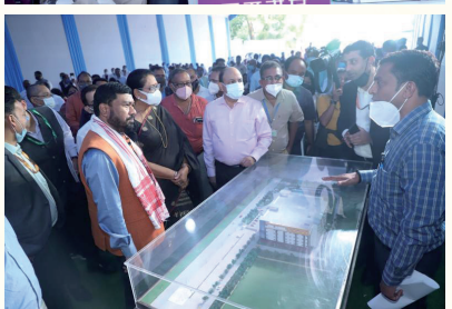
Glimpses of inspection & kickstart of construction work of 200 bedded ESIC Hospital in Guwahati (Assam)

the quality & quantity of such Primary Medical Care services.