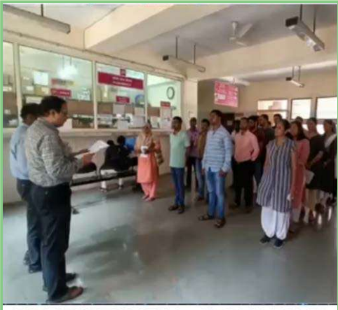
ESIC HOSPITAL, KOLHAPUR