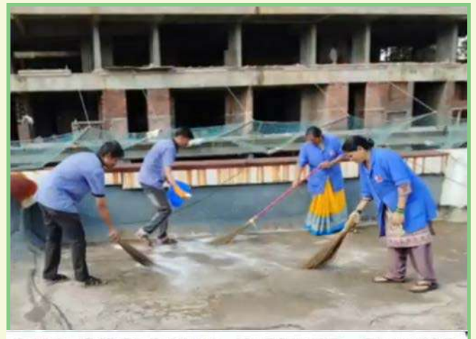
SUB REGIONAL OFFICE, THANE

(15.09.2023 - 02.10.2023) at multiple locations across the country. Everyone present during the drive joined in the initiative to keep the surroundings clean and healthy.